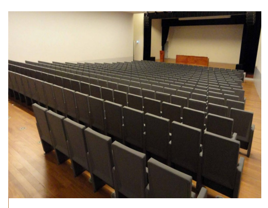
Bizkaia Aretoa Conference Room